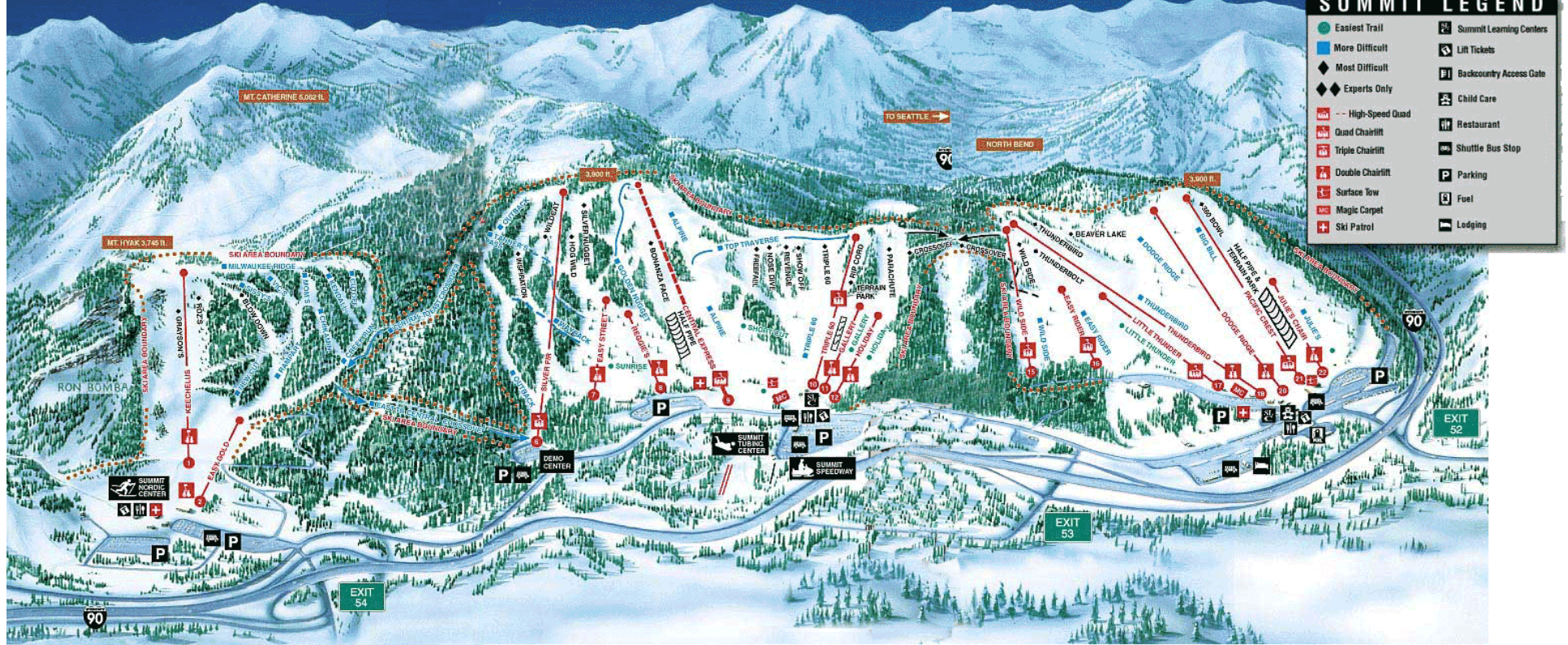
Summit at Snoqualmie